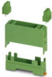
Electronic housing set, consisting of electronic housing and printed circuit termination blocks, pitch 5

Please be informed that the data shown in this PDF Document is generated from our Online Catalog. Please find the complete data in the user's documentation. Our General Terms of Use for Downloads are valid ( http://download.phoenixcontact.com )