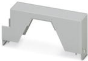
Upper part of housing, for COMBICON connection, single-level

Please be informed that the data shown in this PDF Document is generated from our Online Catalog. Please find the complete data in the user's documentation. Our General Terms of Use for Downloads are valid ( http://download.phoenixcontact.com )