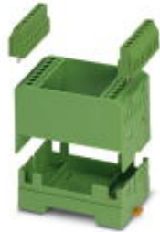
Electronic housing set, consisting of electronic module and printed circuit termination blocks, pitch 5

Please be informed that the data shown in this PDF Document is generated from our Online Catalog. Please find the complete data in the user's documentation. Our General Terms of Use for Downloads are valid ( http://download.phoenixcontact.com )