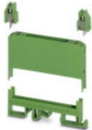
Electronic housing set, consisting of electronic housings and printed circuit termination blocks

Please be informed that the data shown in this PDF Document is generated from our Online Catalog. Please find the complete data in the user's documentation. Our General Terms of Use for Downloads are valid ( http://download.phoenixcontact.com )