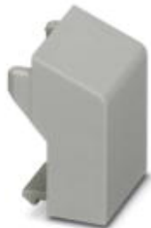
Filler plugs, for unoccupied terminal points

Please be informed that the data shown in this PDF Document is generated from our Online Catalog. Please find the complete data in the user's documentation. Our General Terms of Use for Downloads are valid ( http://download.phoenixcontact.com )