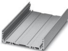
Panel mounting base, Lower part, Color: aluminum, Width: 95 mm

Please be informed that the data shown in this PDF Document is generated from our Online Catalog. Please find the complete data in the user's documentation. Our General Terms of Use for Downloads are valid ( http://download.phoenixcontact.com )