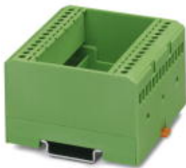
Electronic housing, for PCB insertion, without screw connection terminal blocks and cover

Please be informed that the data shown in this PDF Document is generated from our Online Catalog. Please find the complete data in the user's documentation. Our General Terms of Use for Downloads are valid ( http://download.phoenixcontact.com )