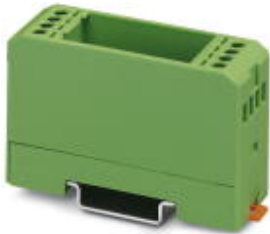
Electronic housing, with snap foot for DIN rail EN 50022 for PCB insertion, without screw connection terminal blocks and cover

Please be informed that the data shown in this PDF Document is generated from our Online Catalog. Please find the complete data in the user's documentation. Our General Terms of Use for Downloads are valid ( http://download.phoenixcontact.com )