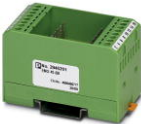
Custom circuit module, consisting of housing, MKDS 3 connection terminal blocks and PCB

Please be informed that the data shown in this PDF Document is generated from our Online Catalog. Please find the complete data in the user's documentation. Our General Terms of Use for Downloads are valid ( http://download.phoenixcontact.com )