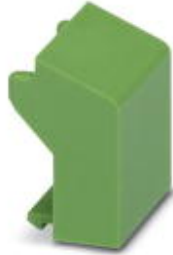
Filler plugs, for unoccupied terminal points

Please be informed that the data shown in this PDF Document is generated from our Online Catalog. Please find the complete data in the user's documentation. Our General Terms of Use for Downloads are valid ( http://download.phoenixcontact.com )