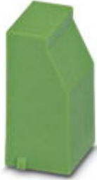
Filler plugs, for unoccupied terminal points

Please be informed that the data shown in this PDF Document is generated from our Online Catalog. Please find the complete data in the user's documentation. Our General Terms of Use for Downloads are valid ( http://download.phoenixcontact.com )