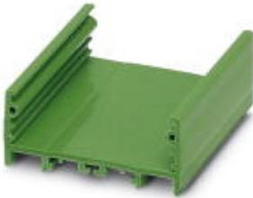
Drawn section panel mounting base, with a constructional width of 45 mm and a fixed length of 200 cm

Please be informed that the data shown in this PDF Document is generated from our Online Catalog. Please find the complete data in the user's documentation. Our General Terms of Use for Downloads are valid ( http://download.phoenixcontact.com )