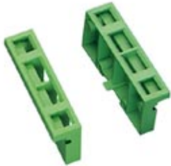
Side element, with marker groove, labeling with SS-ZB. Width: 11 mm, length: 45 mm, height: 21 mm

Please be informed that the data shown in this PDF Document is generated from our Online Catalog. Please find the complete data in the user's documentation. Our General Terms of Use for Downloads are valid ( http://download.phoenixcontact.com )