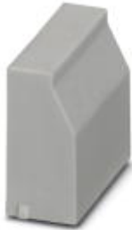
Filler plugs, for unoccupied terminal points

Please be informed that the data shown in this PDF Document is generated from our Online Catalog. Please find the complete data in the user's documentation. Our General Terms of Use for Downloads are valid ( http://download.phoenixcontact.com )