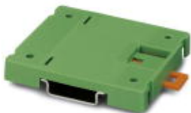
Mounting plate, for screwing on siz 0 switchgear

Please be informed that the data shown in this PDF Document is generated from our Online Catalog. Please find the complete data in the user's documentation. Our General Terms of Use for Downloads are valid ( http://download.phoenixcontact.com )