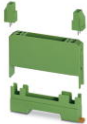
Electronic housing set, consisting of electronic housing and printed circuit termination blocks, pitch 5

Please be informed that the data shown in this PDF Document is generated from our Online Catalog. Please find the complete data in the user's documentation. Our General Terms of Use for Downloads are valid ( http://download.phoenixcontact.com )