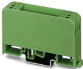
Electronic housing, with universal foot, for p.c.b. insertion, without screw connection terminal blocks and cover, pitch 5

Please be informed that the data shown in this PDF Document is generated from our Online Catalog. Please find the complete data in the user's documentation. Our General Terms of Use for Downloads are valid ( http://download.phoenixcontact.com )