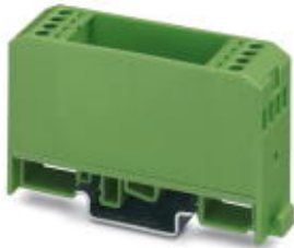
Electronic housing, with universal foot, for PCB insertion, without screw connection terminal blocks and cover

Please be informed that the data shown in this PDF Document is generated from our Online Catalog. Please find the complete data in the user's documentation. Our General Terms of Use for Downloads are valid ( http://download.phoenixcontact.com )