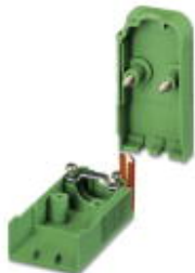
Cable housing, Pitch: 0 mm, Number of positions: 3, Dimension a: 24.66 mm, Color: green

Please be informed that the data shown in this PDF Document is generated from our Online Catalog. Please find the complete data in the user's documentation. Our General Terms of Use for Downloads are valid ( http://download.phoenixcontact.com )