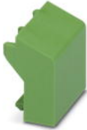
Filler plugs, for unoccupied terminal points

Please be informed that the data shown in this PDF Document is generated from our Online Catalog. Please find the complete data in the user's documentation. Our General Terms of Use for Downloads are valid ( http://download.phoenixcontact.com )