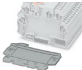
Side cover, for closing the housing for IP20 protection

Please be informed that the data shown in this PDF Document is generated from our Online Catalog. Please find the complete data in the user's documentation. Our General Terms of Use for Downloads are valid ( http://download.phoenixcontact.com )