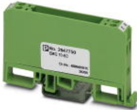
Custom circuit module, consisting of housing, MKDS 3 connection terminal blocks and PCB

Please be informed that the data shown in this PDF Document is generated from our Online Catalog. Please find the complete data in the user's documentation. Our General Terms of Use for Downloads are valid ( http://download.phoenixcontact.com )