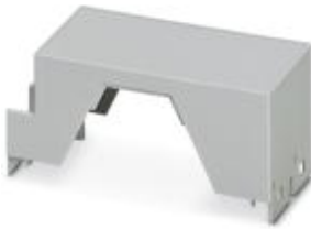
Upper part of housing, for COMBICON connection, single-level

Please be informed that the data shown in this PDF Document is generated from our Online Catalog. Please find the complete data in the user's documentation. Our General Terms of Use for Downloads are valid ( http://download.phoenixcontact.com )