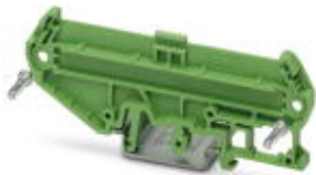
Side element, right, with foot, width: 5 mm, width: 72 mm, for mounting on NS 32 or NS 35/7.5

Please be informed that the data shown in this PDF Document is generated from our Online Catalog. Please find the complete data in the user's documentation. Our General Terms of Use for Downloads are valid ( http://download.phoenixcontact.com )