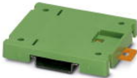
Mounting plate, for screwing on siz 0 switchgear

Please be informed that the data shown in this PDF Document is generated from our Online Catalog. Please find the complete data in the user's documentation. Our General Terms of Use for Downloads are valid ( http://download.phoenixcontact.com )