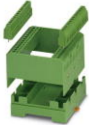
Electronic housing set, consisting of electronic module and printed circuit termination blocks, pitch 5

Please be informed that the data shown in this PDF Document is generated from our Online Catalog. Please find the complete data in the user's documentation. Our General Terms of Use for Downloads are valid ( http://download.phoenixcontact.com )