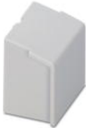
Filler plug for unoccupied terminal points, color: Light gray

Please be informed that the data shown in this PDF Document is generated from our Online Catalog. Please find the complete data in the user's documentation. Our General Terms of Use for Downloads are valid ( http://download.phoenixcontact.com )