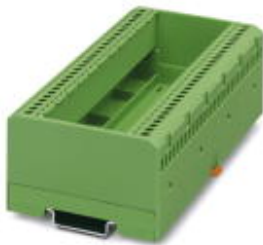
Electronic housing, for PCB insertion, without screw connection terminal blocks and cover

Please be informed that the data shown in this PDF Document is generated from our Online Catalog. Please find the complete data in the user's documentation. Our General Terms of Use for Downloads are valid ( http://download.phoenixcontact.com )