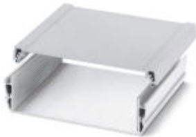
Panel mounting base, Lower part, Color: aluminum, Width: 200 mm

Please be informed that the data shown in this PDF Document is generated from our Online Catalog. Please find the complete data in the user's documentation. Our General Terms of Use for Downloads are valid ( http://download.phoenixcontact.com )