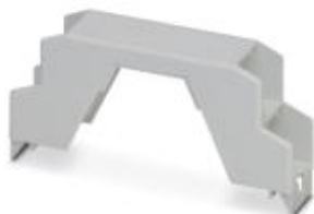
Upper part of housing, for COMBICON connection, double-level

Please be informed that the data shown in this PDF Document is generated from our Online Catalog. Please find the complete data in the user's documentation. Our General Terms of Use for Downloads are valid ( http://download.phoenixcontact.com )