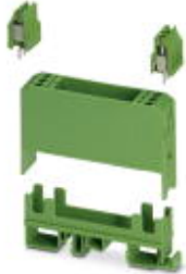
Electronic housing set, consisting of electronic housing and printed circuit termination blocks, pitch 5

Please be informed that the data shown in this PDF Document is generated from our Online Catalog. Please find the complete data in the user's documentation. Our General Terms of Use for Downloads are valid ( http://download.phoenixcontact.com )