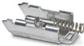
Metal foot catch, for intermediate elements.

Please be informed that the data shown in this PDF Document is generated from our Online Catalog. Please find the complete data in the user's documentation. Our General Terms of Use for Downloads are valid ( http://download.phoenixcontact.com )