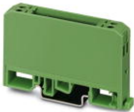
Electronic housing, with universal foot, without screw connection terminal blocks and cover

Please be informed that the data shown in this PDF Document is generated from our Online Catalog. Please find the complete data in the user's documentation. Our General Terms of Use for Downloads are valid ( http://download.phoenixcontact.com )