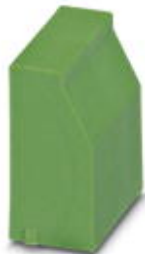
Filler plugs, for unoccupied terminal points

Please be informed that the data shown in this PDF Document is generated from our Online Catalog. Please find the complete data in the user's documentation. Our General Terms of Use for Downloads are valid ( http://download.phoenixcontact.com )