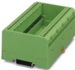
Electronic housing, for PCB insertion, without screw connection terminal blocks and cover

Please be informed that the data shown in this PDF Document is generated from our Online Catalog. Please find the complete data in the user's documentation. Our General Terms of Use for Downloads are valid ( http://download.phoenixcontact.com )