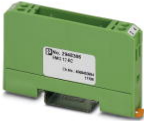
Custom circuit module, consisting of housing, MKDS 3 connection terminal blocks and PCB

Please be informed that the data shown in this PDF Document is generated from our Online Catalog. Please find the complete data in the user's documentation. Our General Terms of Use for Downloads are valid ( http://download.phoenixcontact.com )