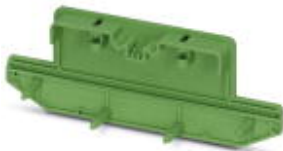
Side element, low-profile version, for 73 mm wide U-shaped cover

Please be informed that the data shown in this PDF Document is generated from our Online Catalog. Please find the complete data in the user's documentation. Our General Terms of Use for Downloads are valid ( http://download.phoenixcontact.com )