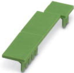
Terminal cover, 1 strip covers up to 12 terminal points, for ME-BUS terminal opening, (male side)

Please be informed that the data shown in this PDF Document is generated from our Online Catalog. Please find the complete data in the user's documentation. Our General Terms of Use for Downloads are valid ( http://download.phoenixcontact.com )