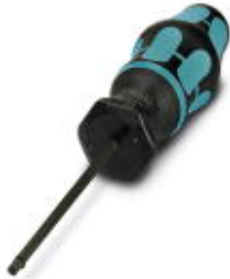
Torque screwdriver, with preset torque of 0.2 Nm and 4 mm hexagonal drive for M8 connectors

Please be informed that the data shown in this PDF Document is generated from our Online Catalog. Please find the complete data in the user's documentation. Our General Terms of Use for Downloads are valid ( http://download.phoenixcontact.com )