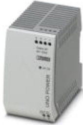
Primary-switched UNO power supply for DIN rail mounting, input: single-phase, output: 24 V DC/100 W

Please be informed that the data shown in this PDF Document is generated from our Online Catalog. Please find the complete data in the user's documentation. Our General Terms of Use for Downloads are valid ( http://download.phoenixcontact.com )