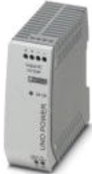
Primary-switched UNO power supply for DIN rail mounting, input: single-phase, output: 12 V DC/55 W

Please be informed that the data shown in this PDF Document is generated from our Online Catalog. Please find the complete data in the user's documentation. Our General Terms of Use for Downloads are valid ( http://download.phoenixcontact.com )