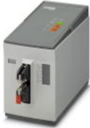
Universal electric crimper to take dies for a wide variety of contact elements

Please be informed that the data shown in this PDF Document is generated from our Online Catalog. Please find the complete data in the user's documentation. Our General Terms of Use for Downloads are valid ( http://download.phoenixcontact.com )