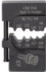
Die, for Crimpfox-M, for coaxial connectors (BNC/TNC) RG 58/ 59/ 62/ 71, packed in a serial storage box

Please be informed that the data shown in this PDF Document is generated from our Online Catalog. Please find the complete data in the user's documentation. Our General Terms of Use for Downloads are valid ( http://download.phoenixcontact.com )