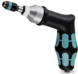
Torque screw driver, accuracy as per EN ISO 6789 standard, adjustable from 3 - 6 Nm

Please be informed that the data shown in this PDF Document is generated from our Online Catalog. Please find the complete data in the user's documentation. Our General Terms of Use for Downloads are valid ( http://download.phoenixcontact.com )