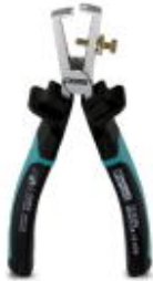
Stripping pliers, for stripping conductors with a cross section of up to 10 mm 2 , VDE-tested

Please be informed that the data shown in this PDF Document is generated from our Online Catalog. Please find the complete data in the user's documentation. Our General Terms of Use for Downloads are valid ( http://download.phoenixcontact.com )