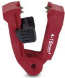
Replacement blade for WIREFOX 16, for cables and conductors of 4 - 16 mm 2

Please be informed that the data shown in this PDF Document is generated from our Online Catalog. Please find the complete data in the user's documentation. Our General Terms of Use for Downloads are valid ( http://download.phoenixcontact.com )