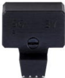
Die (upper part), for CRIMPFOX-C120, for ferrules (DIN 46228) 70 mm 2 , trapeze crimp

Please be informed that the data shown in this PDF Document is generated from our Online Catalog. Please find the complete data in the user's documentation. Our General Terms of Use for Downloads are valid ( http://download.phoenixcontact.com )