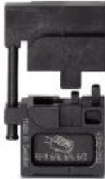
Die, for Crimpfox-M, for unshielded RJ11 connectors, packed in a serial storage box

Please be informed that the data shown in this PDF Document is generated from our Online Catalog. Please find the complete data in the user's documentation. Our General Terms of Use for Downloads are valid ( http://download.phoenixcontact.com )