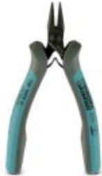
ESD electronic needle-nose pliers, 45° angle, smooth grip, with opening spring, non-reflective coating and phosphate-treated, two-component grip

Please be informed that the data shown in this PDF Document is generated from our Online Catalog. Please find the complete data in the user's documentation. Our General Terms of Use for Downloads are valid ( http://download.phoenixcontact.com )