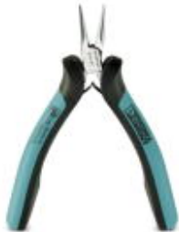
Electronic needle-nose pliers, smooth grip, with opening spring

Please be informed that the data shown in this PDF Document is generated from our Online Catalog. Please find the complete data in the user's documentation. Our General Terms of Use for Downloads are valid ( http://download.phoenixcontact.com )